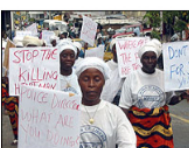
women accuse the authorities of failing to act on the killings

Hundreds of Liberian women have taken to the streets of the capital, Monrovia, protesting against a recent wave of ritual killings at the capital. Bodies of children have been found with some of their organs missing, taken for what are viewed as magical properties. The women, dressed in white, stormed the Justice Ministry demanding action against the killers. Politicians and the wealthy are believed to pay for the murders to increase their chances of good fortune.