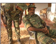
The Tamil Tigers accuse Colonel Karuna (right) of treason

About 5,000 people have rallied in the eastern Sri Lankan town of Batticaloa in support of breakaway Tamil Tiger leader Colonel Karuna. Colonel Karuna split from the main Tigers group this month, complaining the east was not being represented by the rebels' northern-based leaders. The protesters burned photos of the main commander, Velupillai Prabhakaran. The split has thrown further doubt on the island's two-year-old ceasefire and fragile peace process.