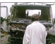
The fighting around Wana is described as fierce

Pakistani forces say they have surrounded up to 400 heavily-armed militants near the Afghan border and are closing in on them. A military spokesman said at least two of the fighters had died attempting to break the cordon on Friday. There is speculation that a senior al-Qaeda leader, possibly Osama Bin Laden's deputy Ayman al-Zawahri, is among those cornered.