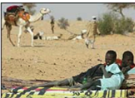
Aid agencies cannot get help to thousands of displaced people