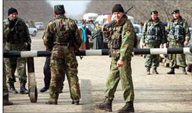
From Our Own Checkpoints have become targets of suicide bombs

Chechen rebels claim there has been another suicide car bomb attack on Russian positions in Chechnya - the third such attack within six days.