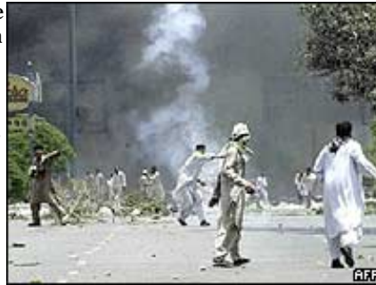
Sunni Muslims rioted on Sunday after the cleric's killing

Blast rocks Karachi Shia mosque A bomb blast has killed at least 10 people and injured about 50 at a Shia mosque in the southern Pakistani city of Karachi, correspondents say.