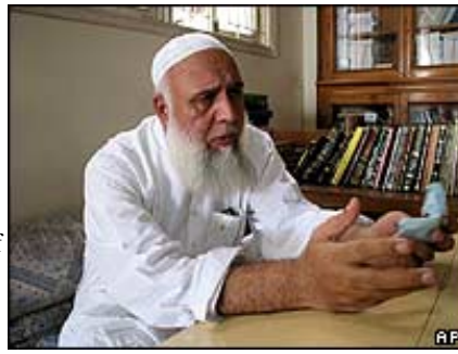
The car of Mufti Shamzai was ambushed by up to six gunmen

As many as 4,000 people have been killed in Pakistan since the late 1980s in Shia-Sunni sectarian violence.