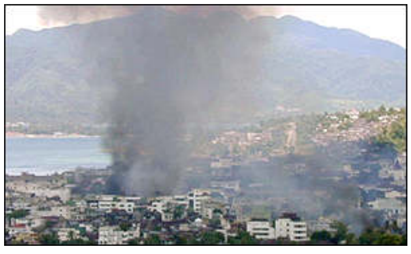
Thousands have died in the last two years

One person has been killed and at least seven injured after home-made bombs were thrown into a Christian procession in Indonesia's troubled Moluccan islands.