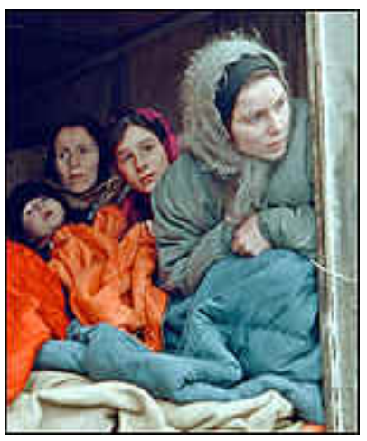
Some families have been returning to Chechnya - but are they going voluntarily?