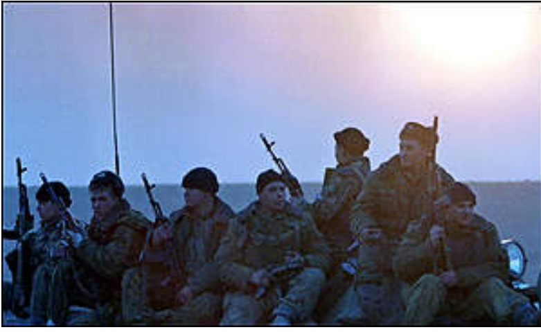
Correspondent Russian soldiers returning from the Grozny front

America Civilians fleeing Grozny are reporting a merciless <u>UK</u> Russian artillery bombardment of the city, despite US <u>UK Politics</u> warnings that Russia is failing to observe international Business human rights standards in the Chechen conflict.