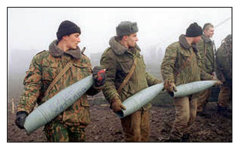
Russian soldiers load artillery shells with the names of the Chechen commanders they are targetting scrawled on the barrels.