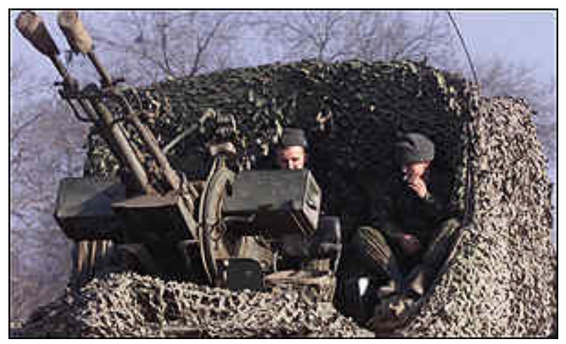
For most Russian soldiers the current campaign has been war at a distance. In an attempt to avoid the massive casualties of its last war in the region, Moscow has tried to shell Chechnya into submission.

Chechen rebels resting from battle. They are believed to be highly organised and well armed - their weapons stolen from dead or captured Russian soldiers.