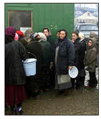
Refugees queue for food in a camp at Karabulak

There were reports that some refugees had had in a c food ration cards withdrawn to pressure them to go.