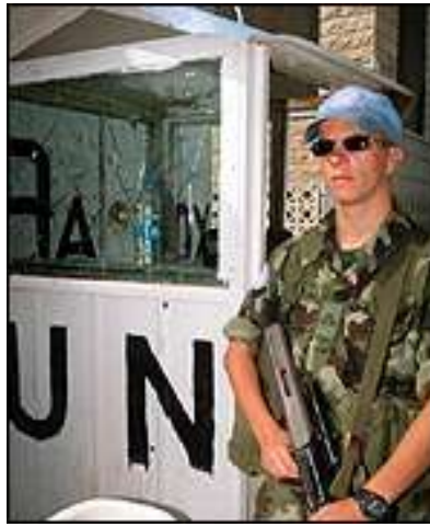
The future of UN peacekeepers is being reviewed