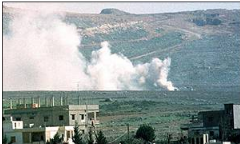
The SLA mans the most dangerous Israeli outposts

Three members of Israel's allied militia were killed when guerrillas blew up a military position during a fierce bombardment against occupation outposts in southern Lebanon.