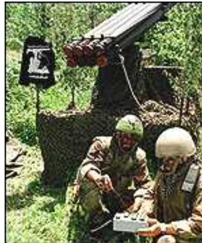
Hezbollah launched co-ordinated attacks across the zone