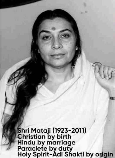
Shri Mataji (1923–2011) Christian by birth Hindu by marriage Paraclete by duty Holy Spirit-Adi Shakti by origin